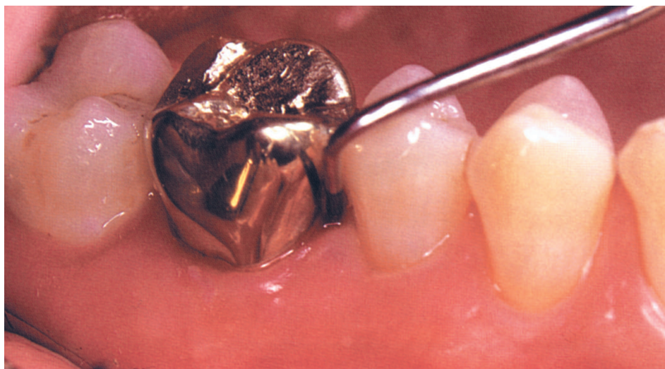
Figures 2 and 3. It is easy to be deceived by the clinical appearance of gingival tissues which may appear healthy on the surface, but which may have deep pockets which always have subgingival infection. These two photos show bleeding on probing indicating inflammation and current infection.

with poor oral health to seek cardiac examinations, even if they do not exhibit symptoms of heart disease. Researchers are actively working to develop an understanding of the underlying factors contributing to this unusually high correlation between periodontal disease and systemic diseases.