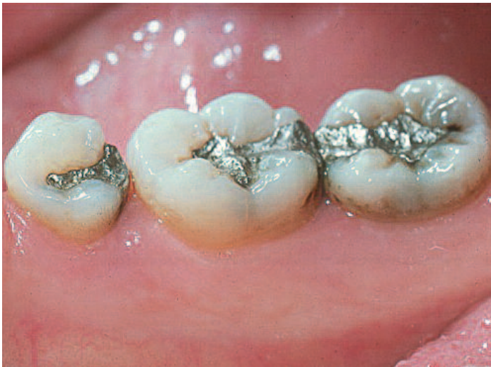
Figure 4. After scaling, root planing and antimicrobial therapy, the gingival tissues appear clinically healthy.