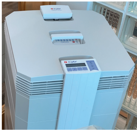
Figure 3. An air purifying/ filter system can be placed in each operatory.

4. When available, some offices are planning to use the Abbott ID NOW