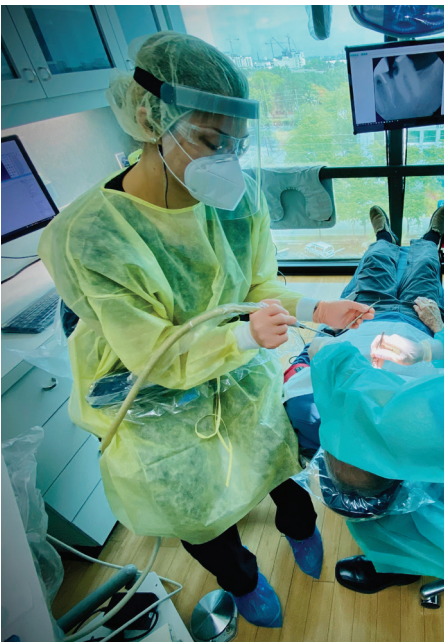
Figure 1. Gloves, mask, face shield, hair covering, scrubs, gown and foot coverings are the first line of prevention for doctors and staff.

ADA and CDC for dentists and staff to safely and effectively treat patients, along with ideas from other practices.