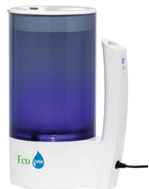
Figure 2. An inexpensive system used to generate hypochlorous acid (HOCL), which is a very effective disinfectant.

2. When scheduling or confirming appointments, screen all patients for symptoms of respiratory illness and contact with possible patients with COVID-19.